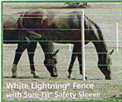
White Lightning® Fence with Sure-Fit® Safety Sleeve